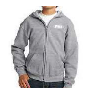
PC90YZH Youth Core Fleece Full-Zip Hooded Sweatshirt 7.8-ounce, 50/50 cotton/poly fleece (XS-XL) Colors: Sport Grey (Shown), Royal, Navy, Black, Red