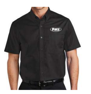
S508 Easy Care Shirt 4.5-ounce, 55/45 cotton/poly

Colors: Royal (Shown), Charcoal, Navy, Sapphire, Jet Black, Graphite Heather, Steel Blue