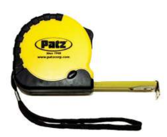
PA-30684 25' Measuring Tape