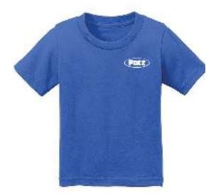
CAR54i Core Cotton Tee 5.4-ounce, 100% cotton (6 Mo-18 Mo) Colors: Royal (Shown), Navy, Black, Pink, Red, Aquatic Blue, Lime