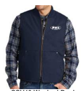
CSV40 Washed Duck Cloth Vest 12-ounce, 100% cotton enzyme-washed duck cloth 100% polyester black taffeta lining quilted to 6-ounce, polyfill insulation *Possible Long Lead Time* Colors: Navy (Shown)

Colors: Dress Blue Navy/Grey Steel (shown), Deep Black/Grey Steel