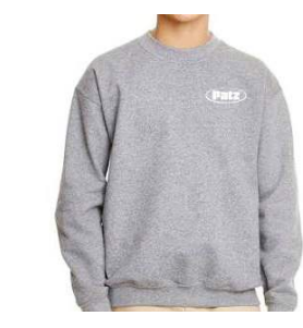
18000B Heavy Blend™ Crewneck Sweatshirt 8-ounce, 50/50 cotton/poly (XS-XL) Colors: Sport Grey (Shown) Royal, Navy, Black, Red