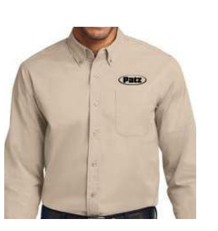
S608 Easy Care Shirt 4.5-ounce, 55/45 cotton/ poly

Colors: Royal (Shown), Charcoal, Navy, Jet Black, Aquatic Blue, Light Blue