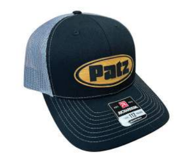
PA-27249 Black & Grey Oval Patch Hat