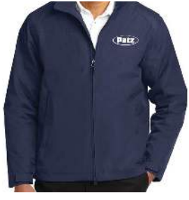
J354 Challenger™ II Jacket Teklon® nylon shell with DWR finish 8.3-ounce, 100% polyester fleece lining

Colors:True Royal (Shown), Dress Blue Navy, Black, Grey Steel, Stratus Grey