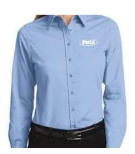
L608 Easy Care Shirt 4.5-ounce, 55/45 cotton/poly

Colors: Royal (Shown), Strong Blue, Light Stone, White, Jet Black