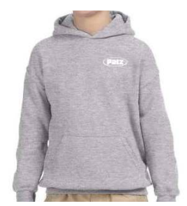
18500B Heavy Blend™ Hooded Sweatshirt 8-ounce, 50/50 cotton/poly (XS-XL) Colors: Sport Grey (Shown), Carolina Blue, Royal, Navy, Charcoal, Black