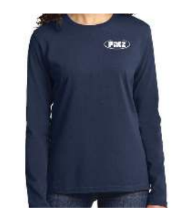
LPC54LS Core Cotton Tee 5.4-ounce, 100% cotton

Colors: Ash (Shown), Royal, Charcoal, Navy, Sapphire, Jet Black, Aquatic Blue, Sangria