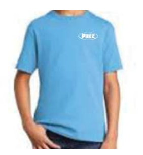
PC54Y Core Cotton Tee 5.4-ounce, 100% cotton (XS-XL) Colors: Aquatic Blue (Shown), Royal, Navy, Charcoal, Black, Sapphire, Bright Aqua, Pink, Lime