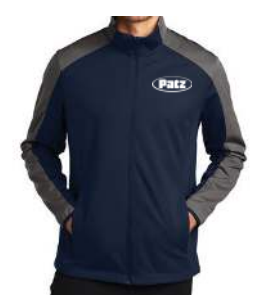
J718 Active Colorblock Soft Shell Jacket 100% polyester knit shell and 100% polyester mesh interior

Colors: Dress Blue Navy/Grey Steel (shown), Deep Black/Grey Steel