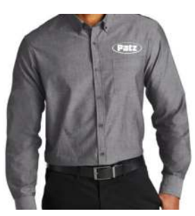
W382 Chambray Easy Care Shirt 2.9-ounce, 60/40 cotton/ polyester chambray

Colors: Deep Black (Shown), Estate Blue, Moonlight Blue