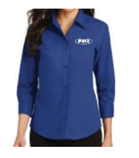
L612 3/4-Sleeve Easv Care Shirt 4.5-ounce, 55/45 cotton/poly

Colors: Royal (Shown), Strong Blue, Light Stone, White, Jet Black