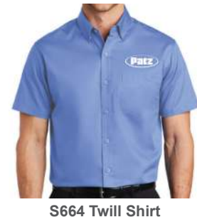
3.4-ounce, 55/45 cotton/poly

Colors: Turquoise (Shown), Strong Blue, Royal, Charcoal Heather Grey, Stone, Black