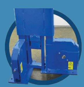
"L" (Corner) Position This setup positions the drive unit in the alley.