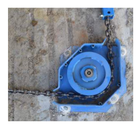
LOW-PROFILE CORNER WHEEL

12" (305 mm) nominal diameter welded plate steel corner wheels feature a low-profile design. 2" (51 mm) diameter hardened axle and nylon sleeve bearings provide low maintenance and long life.