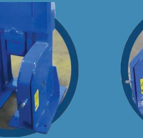
"U" (Parallel) Position Provides space savings and locates the drive unit in a corner out of basic travel routes.