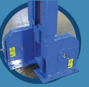
"Z" (Offset) Position narrowing the space required for the drive. Can be used instead of "straight" position.