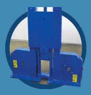
"I" (Straight) Position

Can be placed in straight, corner, parallel, or offset mounting formations for layout flexibility and space savings (see Drive Unit Configurations below). Steel housing encloses drive unit corner wheels for safety and protection. Corner wheels feature hardened axle and nylon bushings for longer life.