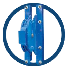
End Wall Mount Wheel

End wheel is designed for mounting on end \underline{or} can be adapted to side walls for easy removal and service.