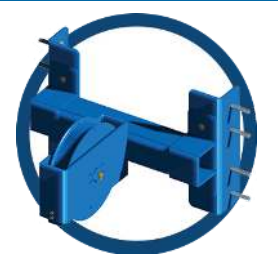
Side Wall Mount Wheel

End wheel is designed for mounting on end \underline{or} can be adapted to side walls for easy removal and service.