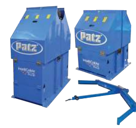
IntelliCable® Alley Scrapers