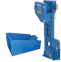
IntelliShuttle® II Chain Box Scraper