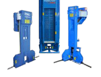
IntelliChain® Alley Scrapers